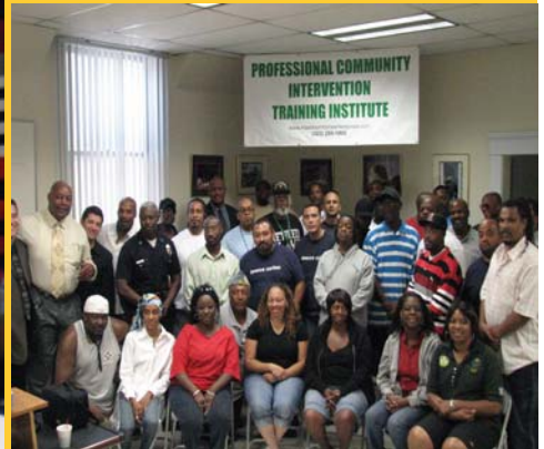
One of our proud graduating classes!

One of A Better LA's most innovative tactics is to fund intervention or "outreach" workers to combat violence in Los Angeles. Outreach workers prove to be effective as they are residents in the communities in which they work, and have a passion for bringing much needed stability to the neighborhood.