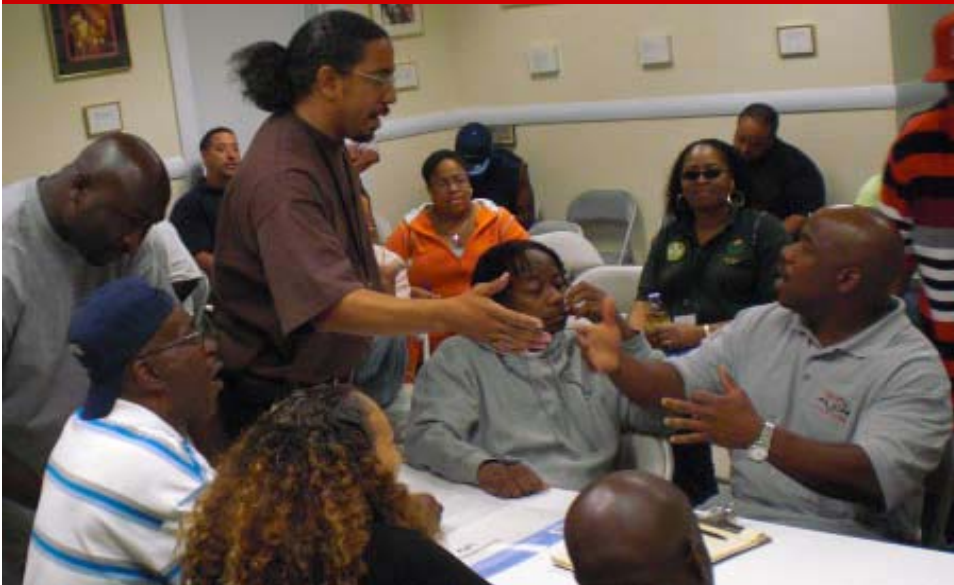
(left) Outreach Workers engage in an exercise in the initial course of PCITI.