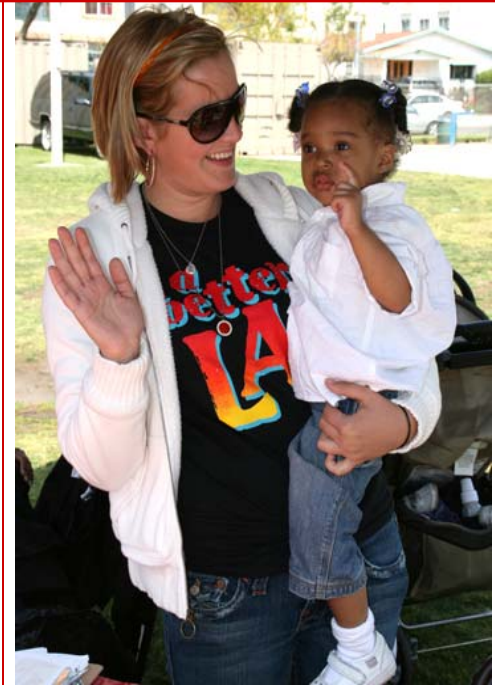
A Better LA volunteer and a friend having a good time at the Easter Egg Hunt

A Better LA partnered with A Foundation For Kids who provided the food, games, crafts, and bounce houses. This incredible event was made possible by A Better LA volunteers who carry and are committed to Pete Carroll's philosophy of doing things better than they have ever been done before, looking to improve all facets of the event, constantly ensuring a positive and enjoyable experience for community families.