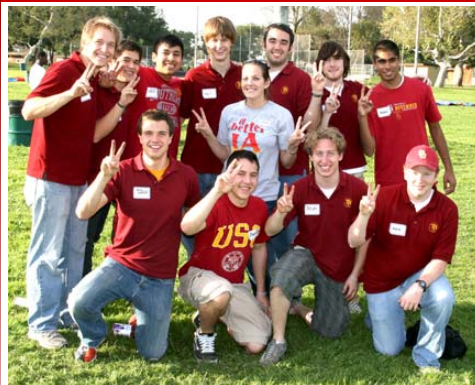
USC's Trojan Knights and A Better LA volunteers at Family Day in Athens Park